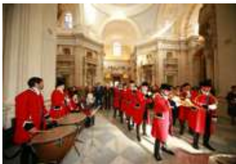
Hunting Horn Players of the Regia Venaria Crew.