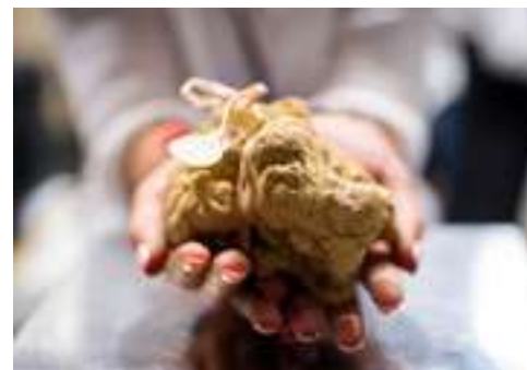
Alba white truffle.