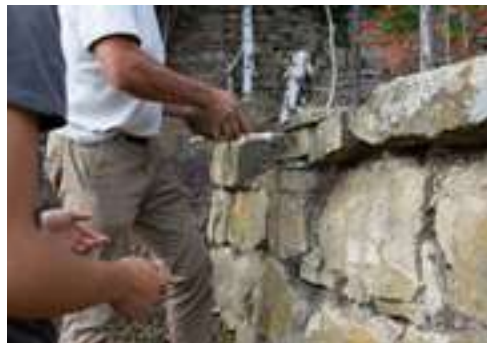
Dry stone walls.

It was inscribed on the Intangible Cultural Heritage list in 2018, as the heritage of eight nations - Cyprus, Croatia, Greece, France, Slovenia, Spain, Switzerland and Italy - which are the spokespeople for a common feeling that recognizes this traditional building technique as having a special value, to be known, preserved and handed down with a view to great responsibility for the future. Building with dry stone means building using only stone as a material. No binder, be it mortar or cement. It is a universal language of experience, of attention to the specific characteristics of places, of careful and far-sighted management of natural resources. Over time, this technique has produced an infinite number of constructions that derive from expedients and details refined over time and respond to the different needs of living and working, of spirituality: dividing walls for the fields, fences for flocks, windbreaks, canals to regiment water, paved and cobbled paths, roof coverings, walls to protect against wild animals and avalanches, small service constructions for agriculture and sheep farming, retaining walls for terraced slopes. Maintaining the preciousness of rural stone landscapes means having the right skills to take care of them, to intervene in a workmanlike manner . It is a know-how that generates work, that strengthens the local economy and that cannot be improvised: one should learn from the masters .