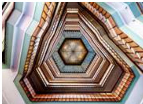
Office building Olivetti, Ivrea. (To) © Visit Piemonte, ph. Gianni Oliva Photography.