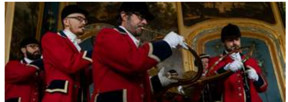
Hunting Horn Players of the Regia Venaria Crew della Regia Venaria.

Truffle hunting and extraction in Italy: traditional knowledge and practice (2021)