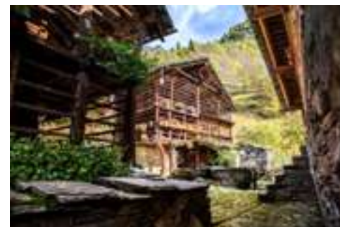
Walser houses, Alagna Valsesia.