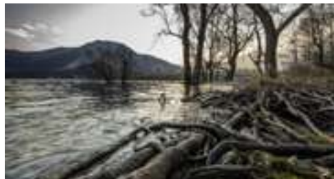
Ticino Val Grande Verbano Biosphere Reserve © ph. Marco Tessaro.

Ticino Val Grande Verbano (2002 and 2018) Monviso (2013) Collina Po (2016)