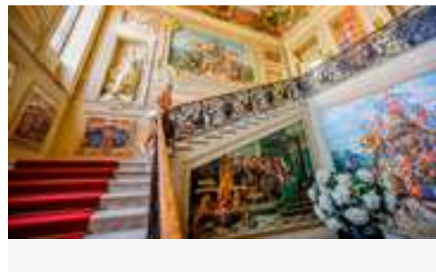
Castello di Racconigi (Cn).