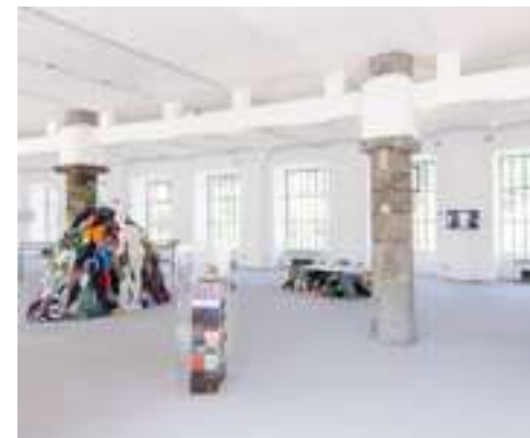
Cittadellarte, Pistoletto Foundation, Biella.