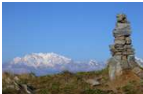
View of Monte Rosa.