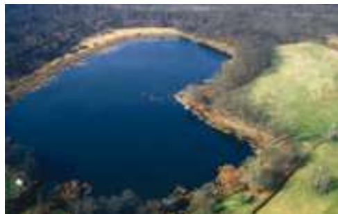
Lagoni of Mercurago, Arona (No).