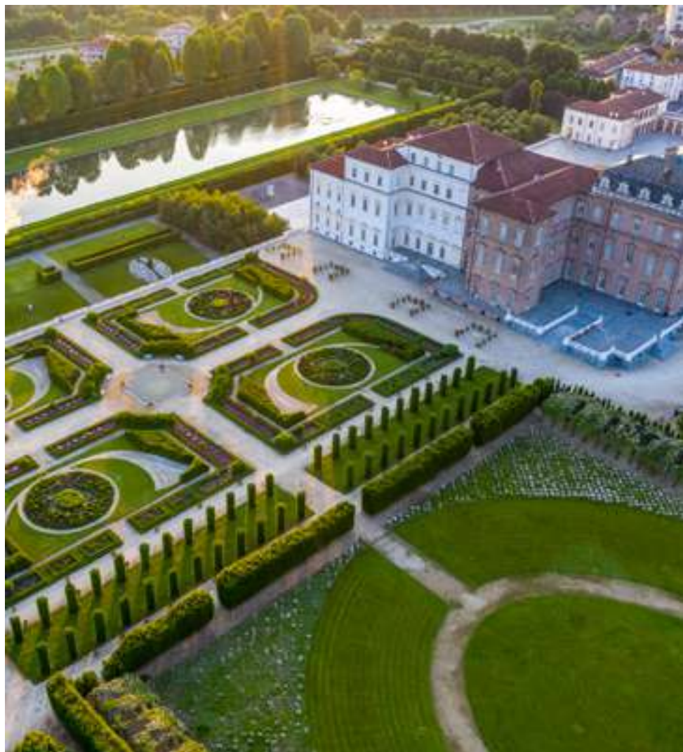
Reggia di Venaria, Venaria Reale (To).