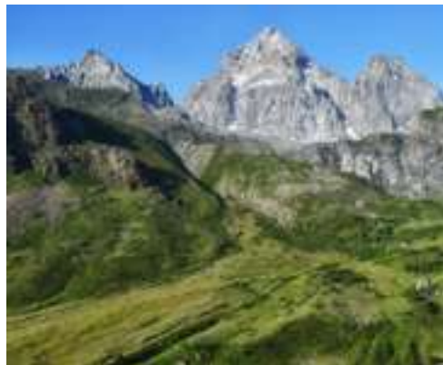
View of Monviso from Pian del Re, Cuneo.