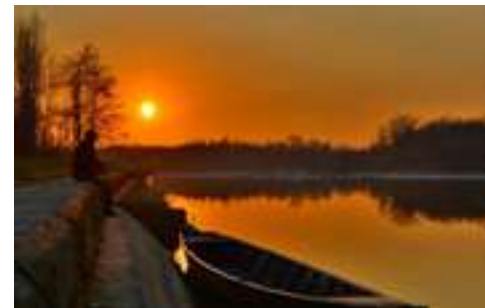
Ticino river.

In 2002, the Valle del Ticino (Ticino Valley) as a whole - covering both Piemonte and Lombardy - was designated as a MAB Biosphere Reserve and became a full member of the World Network of Biosphere Reserves (WNBR). In 2018, the reserve was expanded and now includes more than 200 municipalities, covering more than 332,000 hectares , of which about 18,000 hectares are classified as core areas, 51,000 hectares as buffer zones and 263,000 hectares as transition areas. The provinces involved are Novara, Milan, Pavia, Varese and Verbania. The territory of the Mab Ticino Val Grande Verbano Reserve has a high level of biodiversity, thanks to its rich and varied mosaic of conservation devices made up of around twenty parks and reserves as well as a socio-economic fabric that is strongly interwoven with both the Milan metropolitan area and the agricultural system. The final objective, which the Reserve will work towards in the coming years, is the creation of an Italian-Swiss cross-border Reserve, including the territory around the Ticino River between the sources and the entrance to Lake Maggiore, also known as Upper Ticino, in Switzerland. The two parks included in the new Mab Reserve - the Val Grande National Park and the Campo dei Fiori Park - together with those already recognized in the Valle del Ticino, represent the core and buffer zones , while the municipalities newly included in the extension will represent the transition zone .