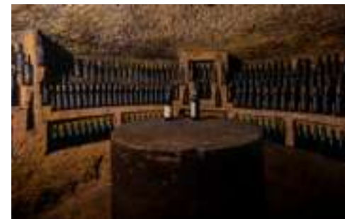
Infernot, Cella Monte (Al).