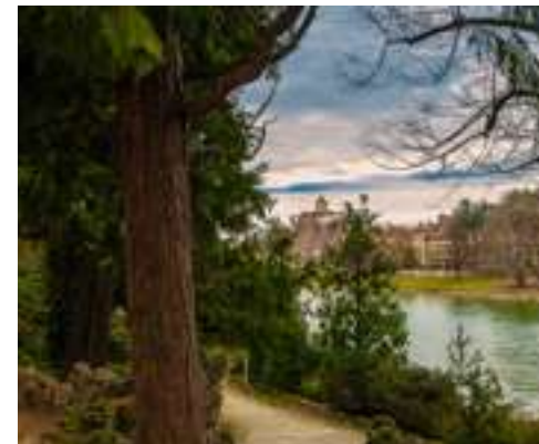
Valentino Park, Torino.