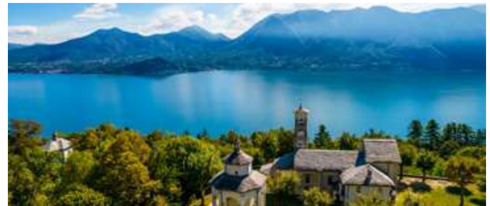
Sacred Mount of Ghiffa (VCO).

Ivrea, industrial city of the 20th century (2018)